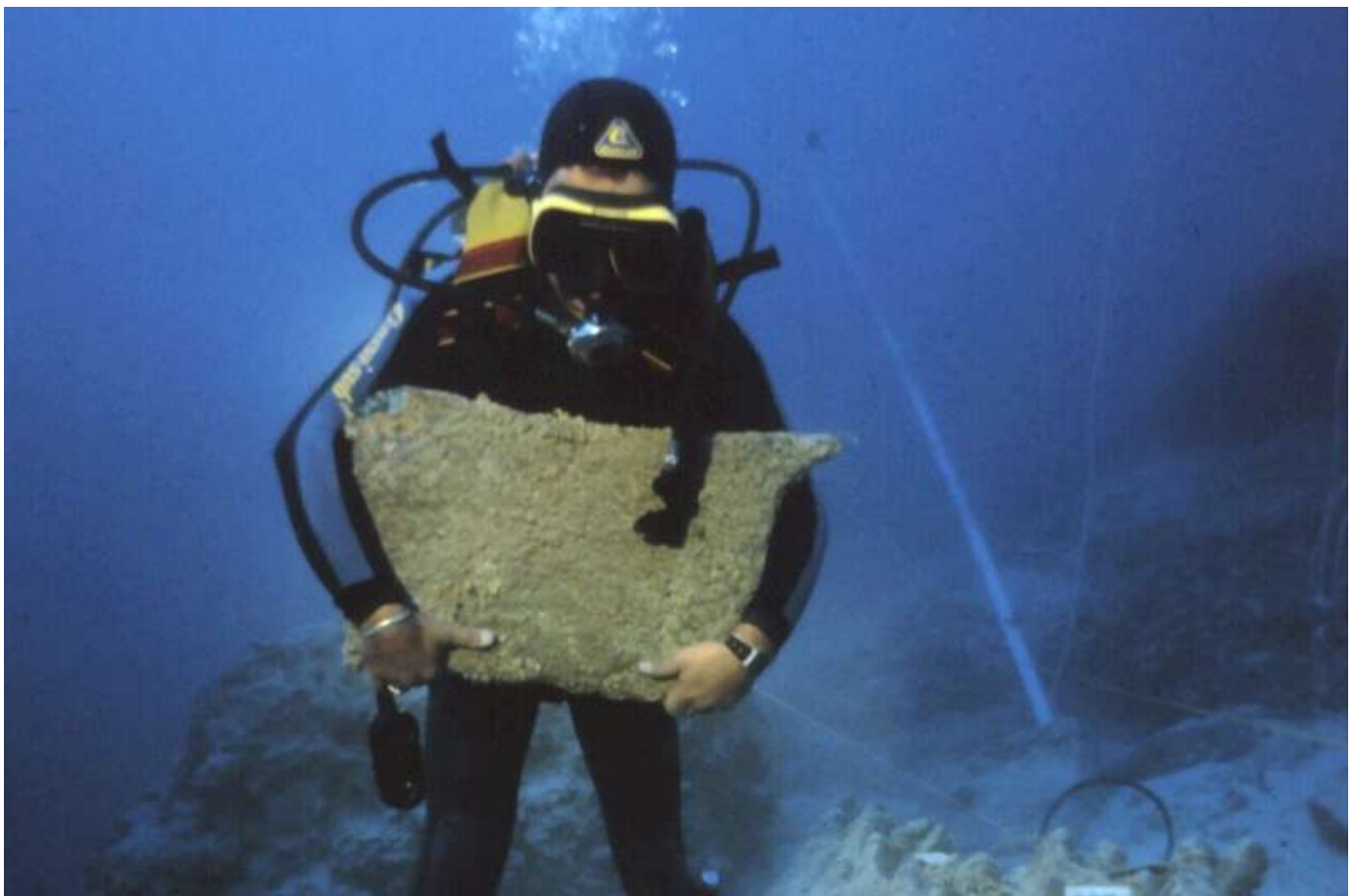
Uluburun excavation images showing copper oxide ingots.

"It's quite amazing to learn that a culturally diverse, multiregional and multivector system of trade underpinned Eurasian tin exchange during the Late Bronze Age."